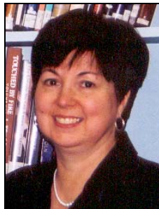
Vice President Professional Development